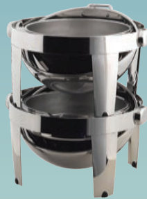
Ibis Round 1A17610C