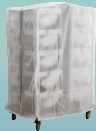
1A91101PVC Trolley Cover