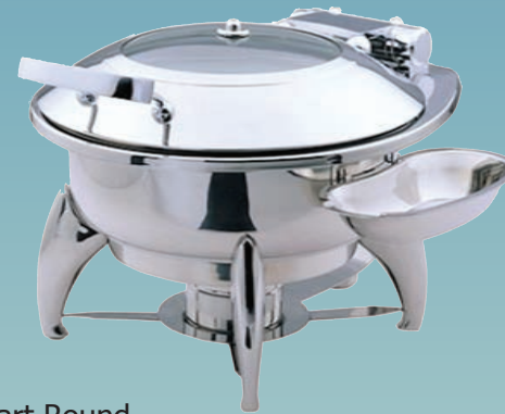
Smart Round 1A15301B