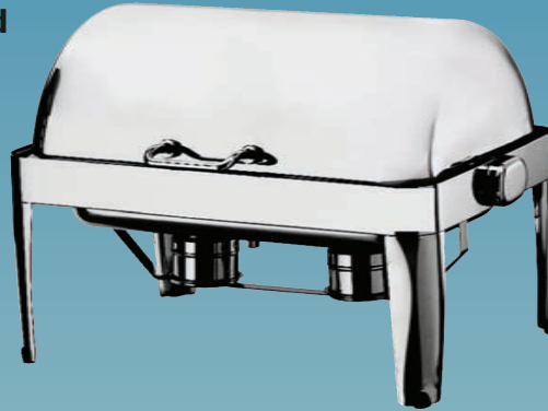
Ibis Oblong 1A17510C